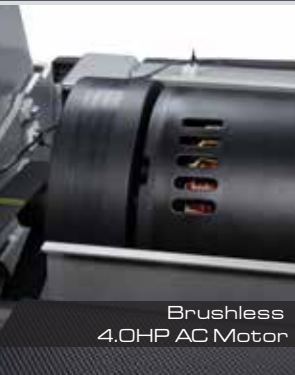
Brushless 4.0HP AC Motor